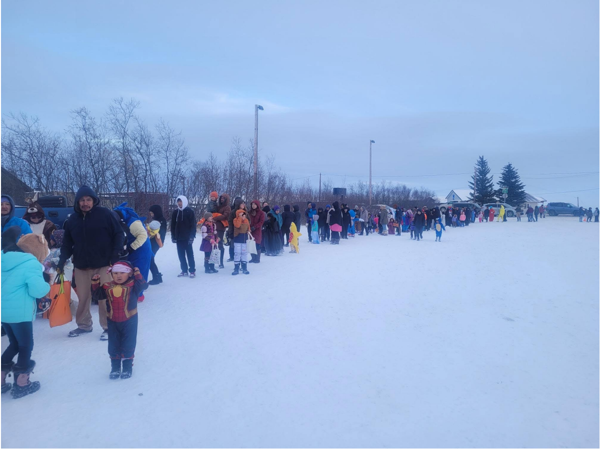
Halloween "Trunk or Treat" 2025