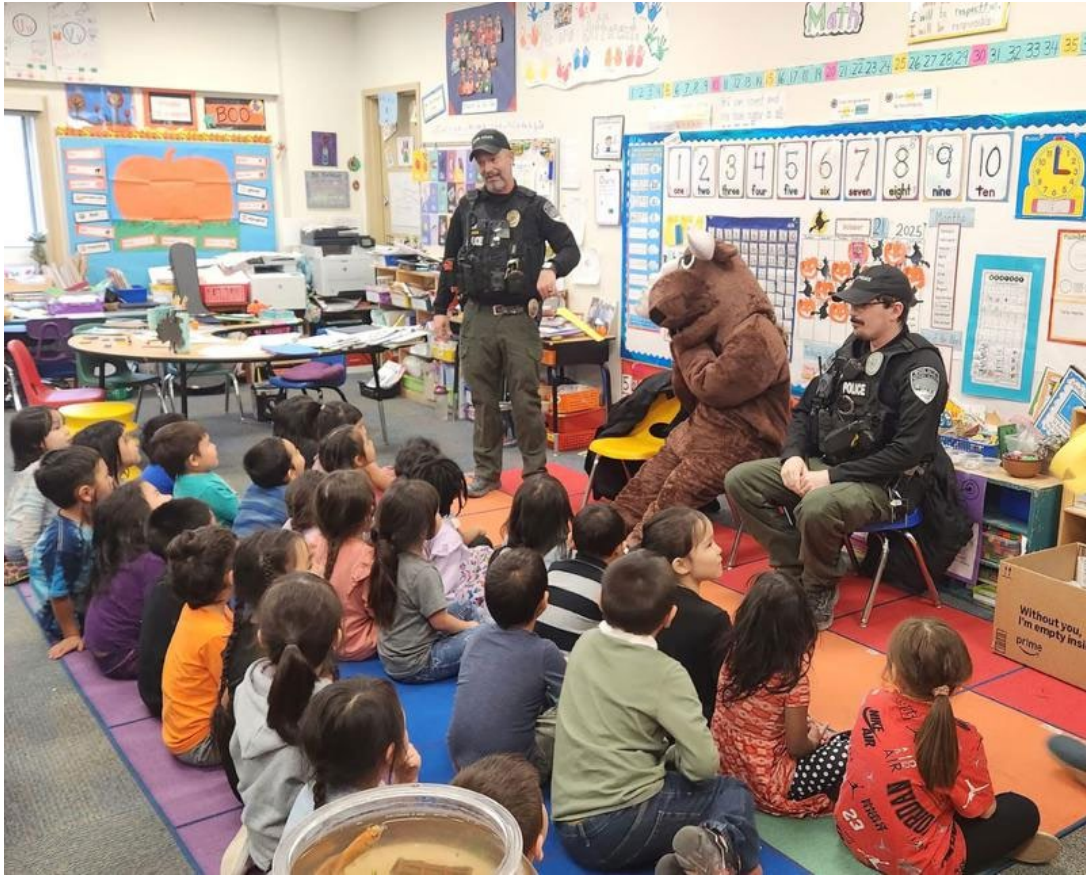
Attended school for Anti-bullying lesson with kindergarten students.